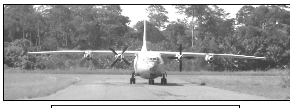
Our chartered cargo plane arrives in Impfondo