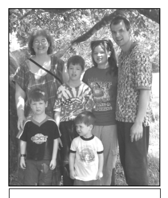
The Burrows Family in Congo