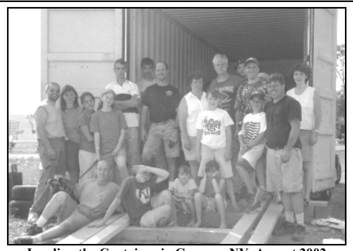
Loading the Container in Geneseo, NY, August 2002