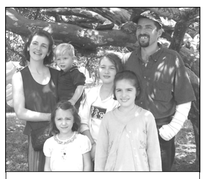
The New Look: Toothless & Shattered

On January 3, 2003, a tire exploded while I was trying to get the bead to seat. The resulting injuries: