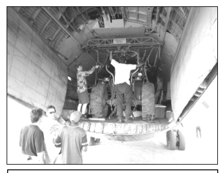
Unloading the plane in Impfondo, October 2002