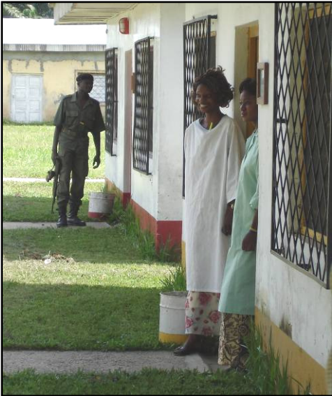
One of the Governor's Bodyguards inspects Pediatrics