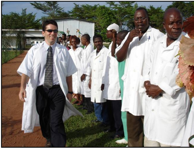
Inspecting the Troops in Preparation for the Ministers' Arrival

The fun didn't stop in Kenya! The Governor of the Likouala Region, the Minister of Health, the Minister of Women, and the World Health Organization Representative to Republic of Congo stopped by for an official inspection on World Health Day , April 7, 2006.