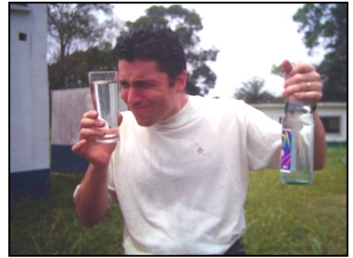
Inspecting water from the new well at the hospital compound

In December we enjoyed a visit from the U.S. Embassy in Brazzaville. The embassy has been instrumental in helping us get authorization to open the hospital, and we are very grateful.