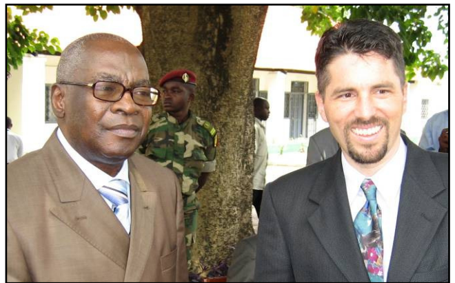
Bringing in a New Year and a New Era with Congo's Minister of Health, January 13, 2006