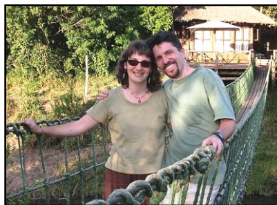
The Happy Couple