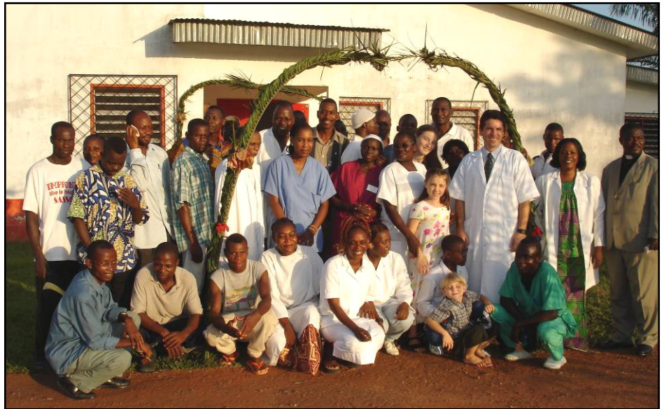
These people truly are a joy to work with!