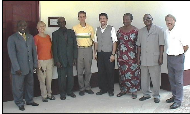
US Embassy Staff outside Surgery, December 2005

And now for the really big news...After five years of hard work, diplomacy & preparation, on January 13, 2006 , we received Official Authorization to start hospitalizing patients.