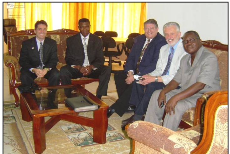
At the Surgeon General's Office in Brazzaville