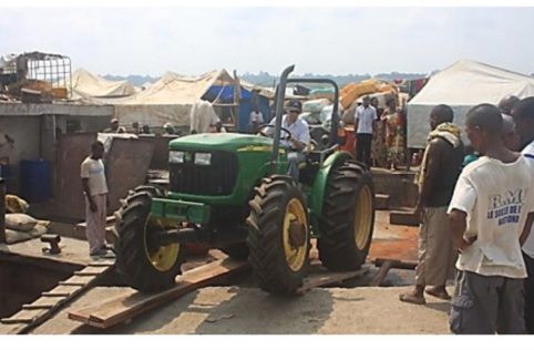
Unloading our new tractor from a river boat – June 30